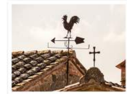
A weather vane is used to show the wind direction.