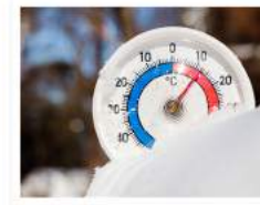
A thermometer is used to measure the temperature.

Weather can be measured using simple equipment.