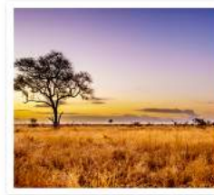
Africa is close to the equator and has a hot climate.