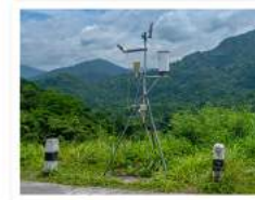
An anemometer is used to measure wind speed.