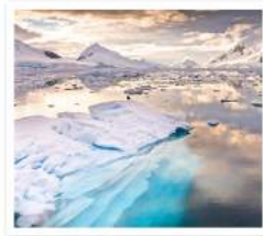
Antarctica is far away from the equator and has a cold climate.

Weather and climate mean different things. Weather is rain, sun or snow and it is changing all the time. Climate is the pattern of weather over a longer time. There are differences in the climate between continents across the world.